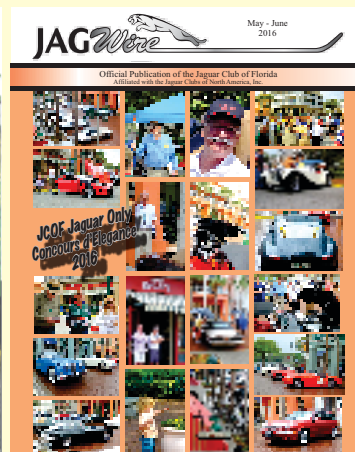
May - June Issue