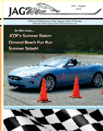
Jul. - Aug. Issue