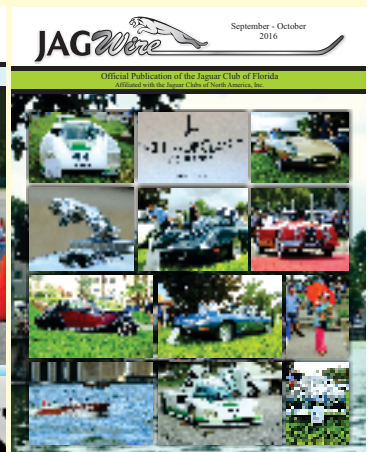
Sept. - Oct. Issue